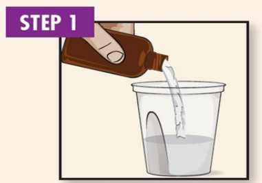
Pour ONE (1) 6-ounce bottle of SUPREP liquid into the mixing container.

You must complete steps 1 through 4 using one (1) 6-ounce bottle Before going to bed