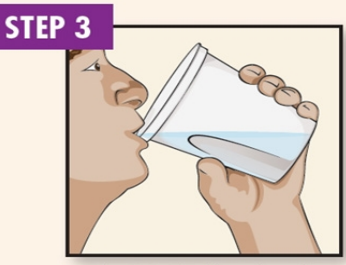
Drink ALL the liquid in the container.

NOTE: Dilute the solution concentrate as directed prior to use.