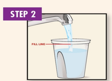
Add cool drinking water to the 16-ounce line on the container and mix.

NOTE: Dilute the solution concentrate as directed prior to use.